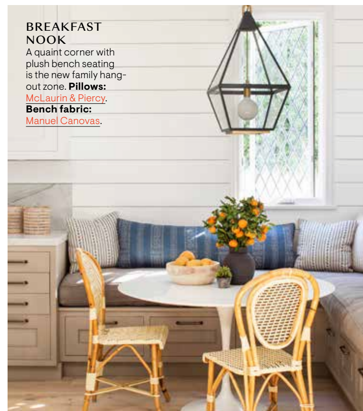
BREAKFAST NOOK A quaint corner with plush bench seating is the new family hang-out zone. Pillows: McLaurin & Piercy. Bench fabric: Manuel Canovas.