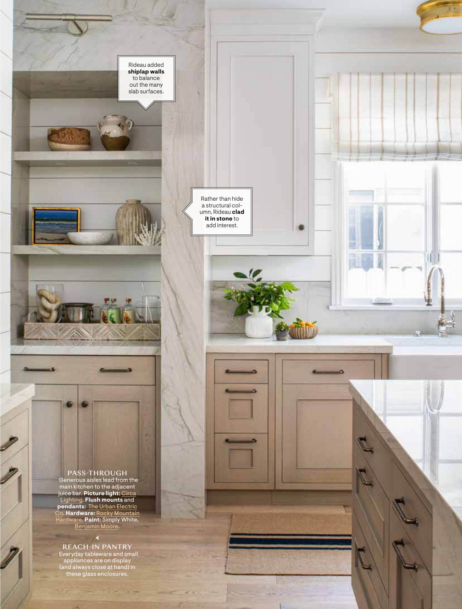
Rideau added shiplap walls to balance out the many slab surfaces.