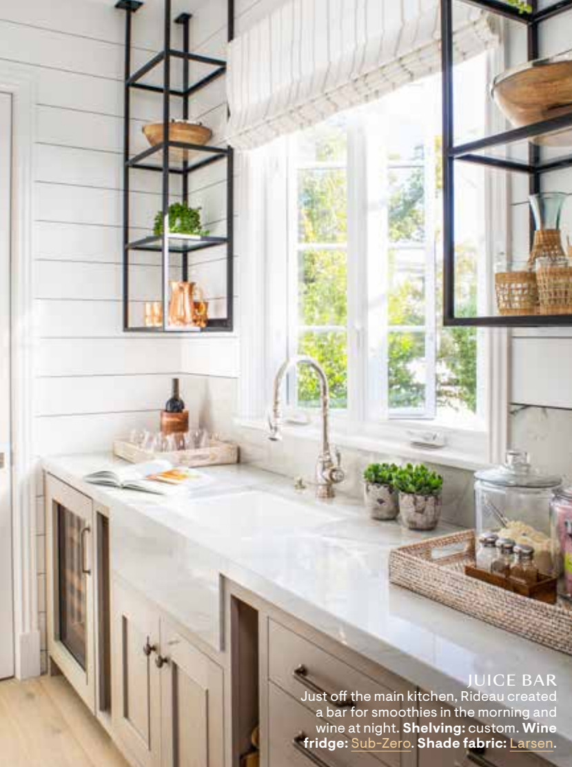
JUICE BAR Just off the main kitchen, Rideau created a bar for smoothies in the morning and wine at night. Shelving: custom. Wine fridge: Sub-Zero. Shade fabric: Larsen.