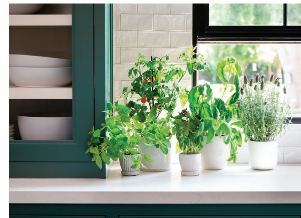
TOP: "I like to use an apron-front sink because the apron keeps water away from the cabinets," designer Caren Rideau says. Black frames prevent the trio of windows from getting lost in the sea of white subway tile. ABOVE: A miniature forest of potted herbs is a subtle echo of the backyard's view. White quartz counters and backsplash tile are easy to clean and brighten the kitchen.